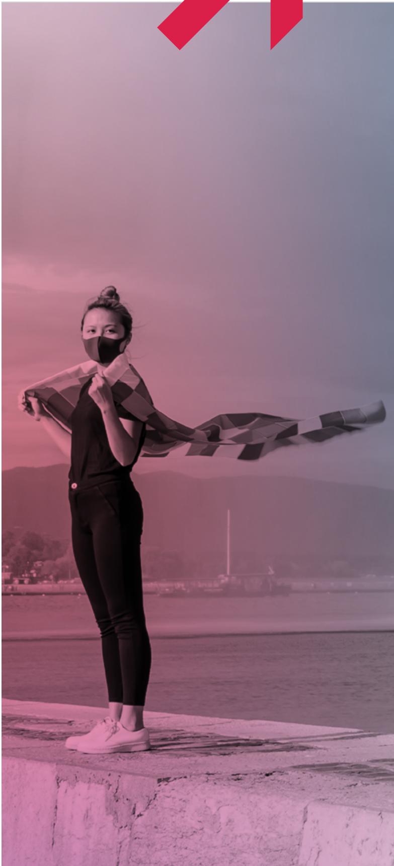
Badiucio's Lennon Wall flag