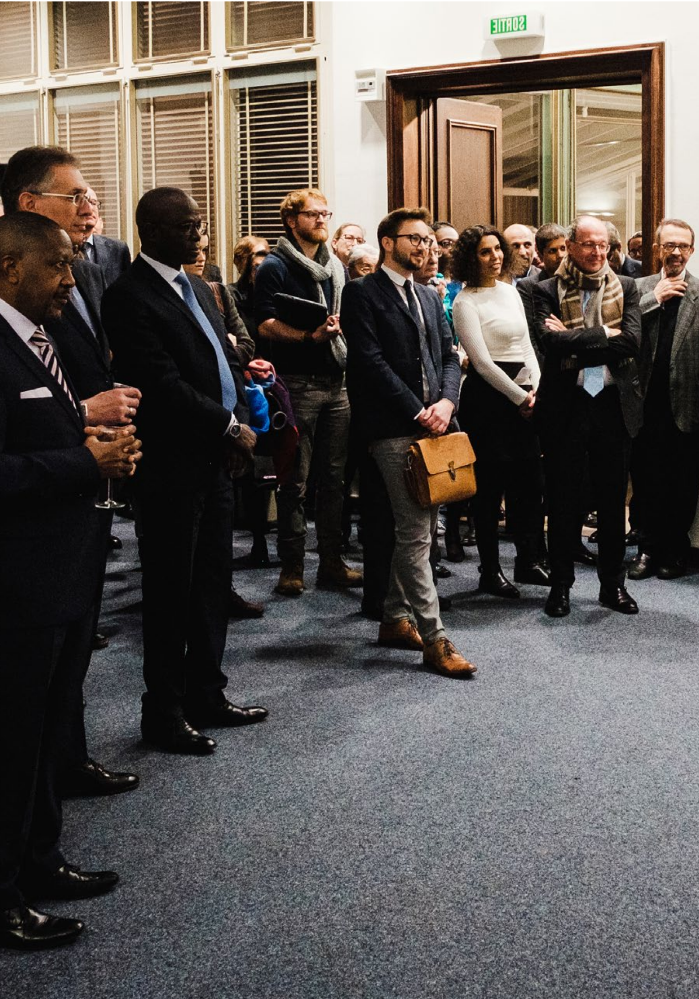
Listening to human right defenders and diplomats