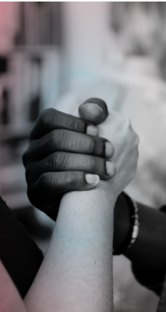
Supporting each other

In accordance with our fundraising strategy, ISHR acquires and prudentially manages the financial resources necessary to flexibly and effectively implement this Strategic Framework, ensure the security, sustainability, agility and effectiveness of the organisation , and establish and maintain a core minimum reserve.