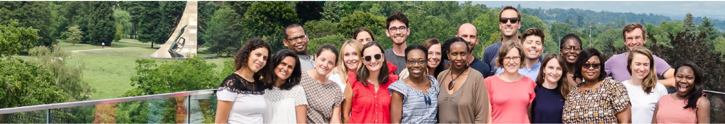
ISHR staff