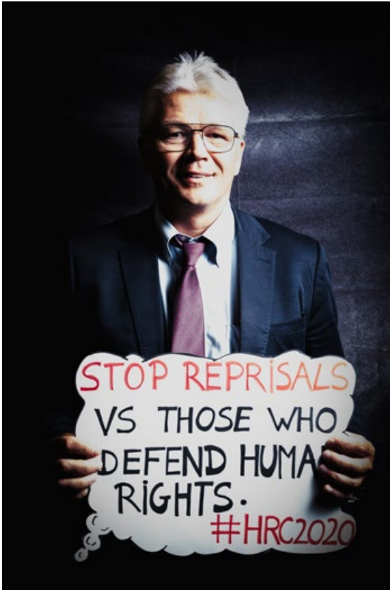
Taking a stance

States respect and protect human rights defenders and fulfil their human rights obligations at the international, regional and national levels, enabling and promoting their work. Businesses and other non-State actors respect human rights and contribute to a safe and enabling environment for defenders where they operate or have influence.