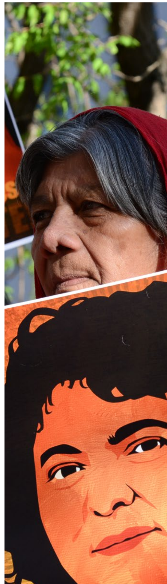
Berta Caceres Protest