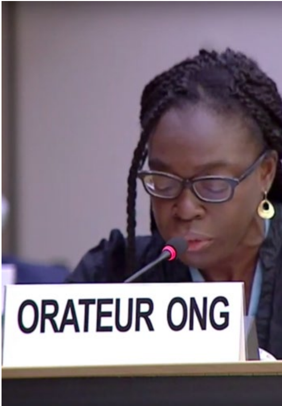
Fanny from ISHR, delivering a statement at the Council

International and regional human rights laws and mechanisms are accessible to human rights defenders and responsive to their demands, and are effective and influential in promoting, protecting and contributing to the realisation of human rights and accountability for violations and abuses.