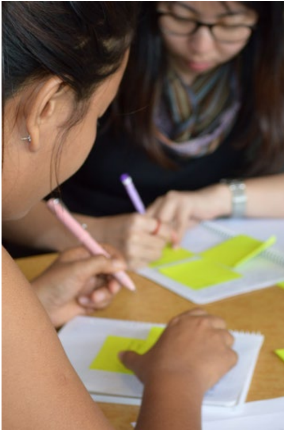
Working together for human rights

Human rights defenders have the tools and networks to be effective and influential in promoting, protecting and contributing to the realisation of human rights.