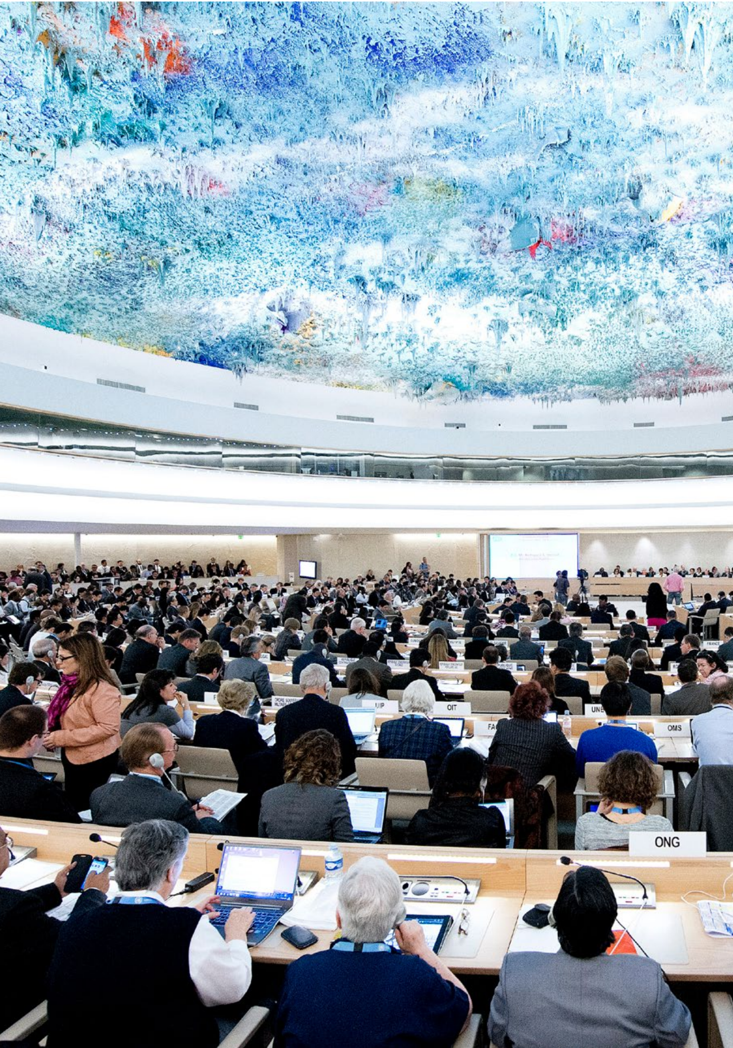
Civil society participation is crucial at the Human Rights Council