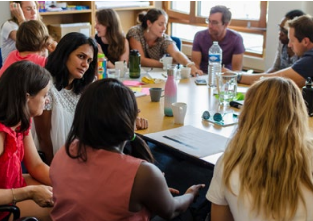
Strategy planning at ISHR