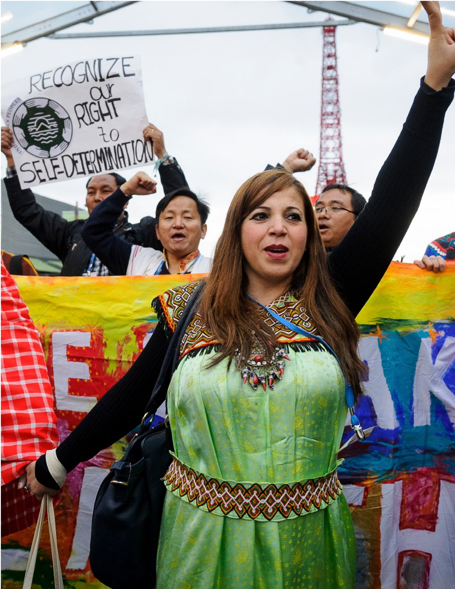
Together we are stronger