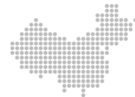
HUMAN RIGHTS DEFENDER, CHINA

'I am inspired by those who continue to struggle for a free Tibet.'