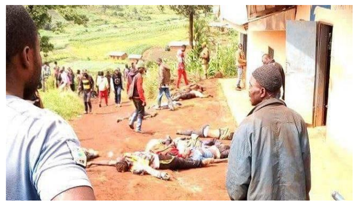
Figure 3: Pinyin massacre