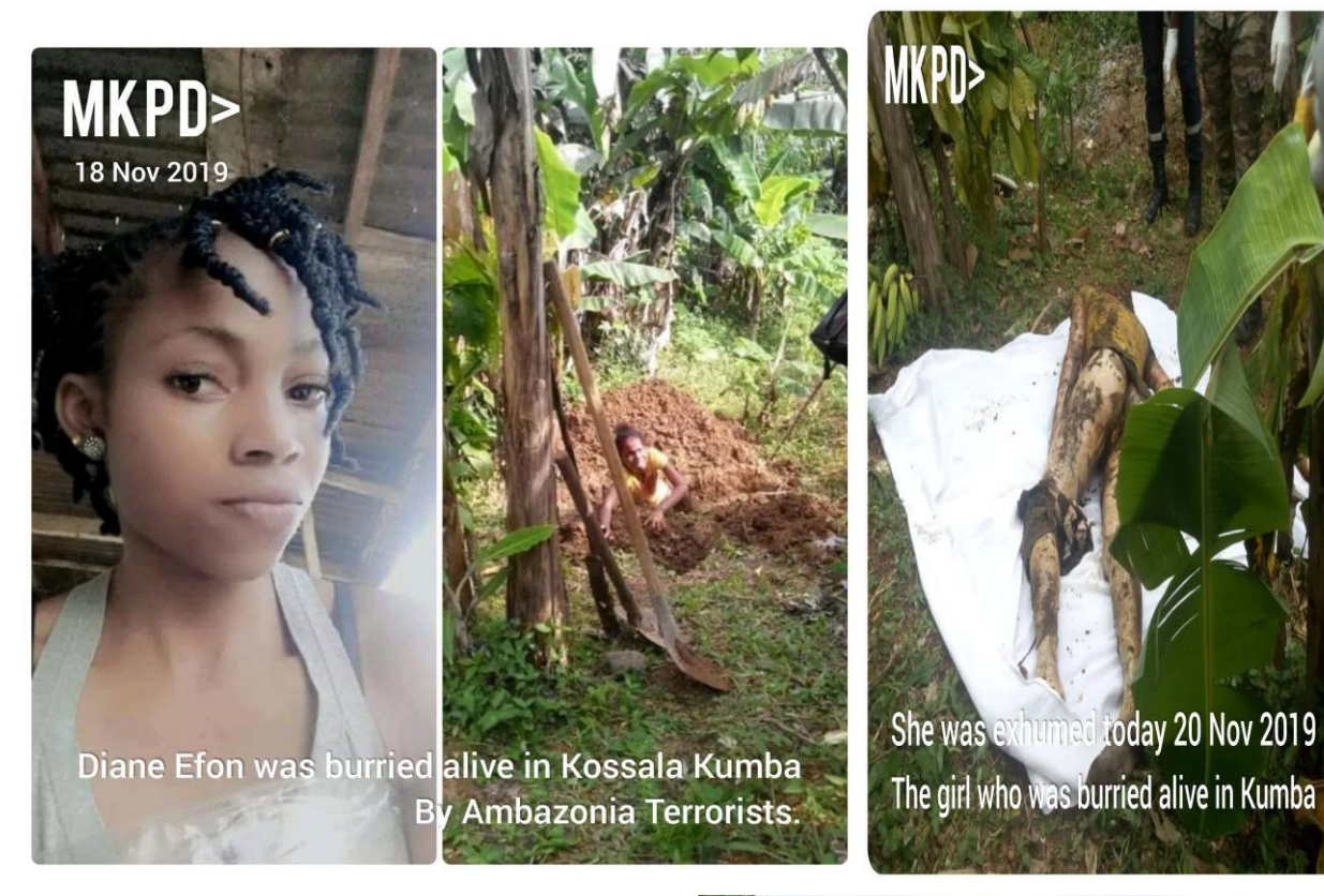
Figure 5: courtesy, MKPD