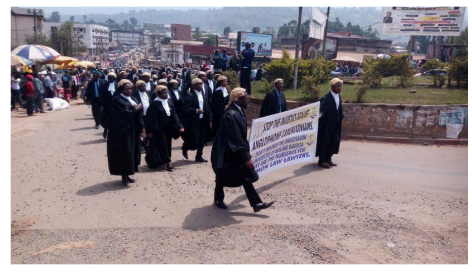
Figure 2: Anglophone lawyers peaceful protest 2016