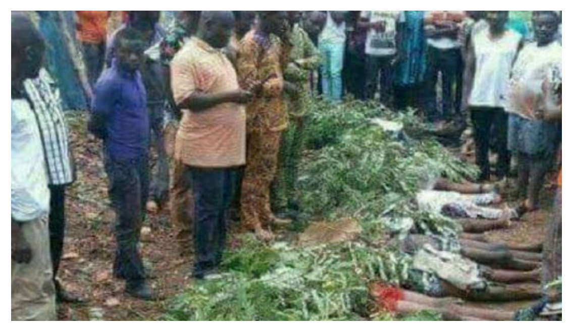
Figure 7: Victims of the Ngarbuh Massacre of February 14 2020 in the NWR on Cameroon