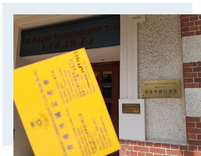
Hong Kong's Foreign Correspondents' Club.

With this structure in place, the NSL reshapes Hong Kong's justice system, muddling a separation of powers that is essential for an independent judiciary. Cases involving national security are presided over by a list of national security judges . 20 These judges are handpicked by the Chief Executive in consultation with the Committee. However, the Chief Justice recently acknowledged that he does not know what criteria the Chief Executive follows when it comes to the selection of national security judges. 21 In addition, the Secretary for Justice and prosecution authorities also have the power to prohibit jury trials for national security cases. 22