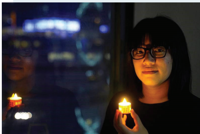
Chow Hang-tung, chairwoman of the Hong Kong Alliance, sentenced on 4 January to 15 months prison.

After insinuating that the 612 Fund could be involved in money laundering, the Hong Kong Secretary of Security issued it with a court order under Article 43 of the NSL to compel the production of information for the investigation of a matter related to national security. The Police are reportedly investigating whether the funding source involves ‘collusion with foreign elements’, as per the scope of the NSL. The Secretary of Treasury and Finance also said the 612 Fund was not registered as a society, company or trade union and urged Hong Kongers to distance themselves from the 612 Fund to avoid being scammed or facing legal risks. 33 These are tactics to alienate a civil society organisation and the access to resources.