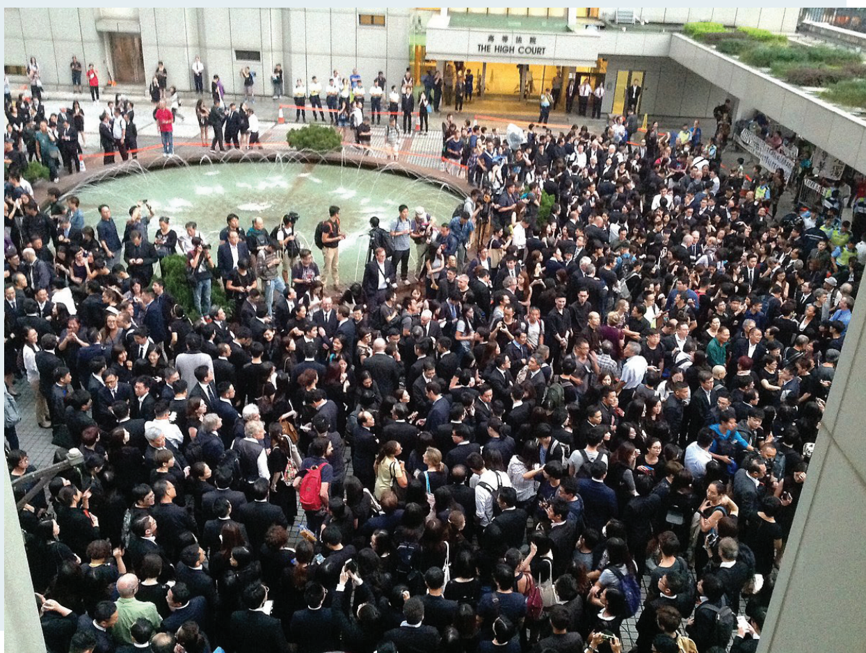
Hong Kong's legal profession held a silent black-clothed parade against the National People's Congress on 08.11.2016.

The Hong Kong Professional Teachers' Union (PTU) was a long-standing trade union of teachers in Hong Kong and supported democracy. Its candidates represented the education sector in the Legislative Council's Functional Constituency since 1985. It was the largest teachers' organisation in Hong Kong with some 95,000 members at the time of disbandment in 2021. In July of that year, two of China's major media outlets, the Xinhua News Agency and the People's Daily, published commentary articles criticising the operation of the PTU for deviating from its original purpose to become an out-and-out political organisation. 'For Hong Kong education to return to the right track, the PTU must be investigated, and the tumour must be eradicated,' said Xinhua. 53 A member of the Executive Council of Hong Kong 54 and lawmaker Regina Ip echoed that PTU was subversive, and called for the authorities to ban the PTU. She posted on her social media, 'The union claims to be a professional teacher's union, and has been using many benefits and perks to attract a large number of teachers to become their members, luring them to follow the union's radical anti-China stance.' 55 PTU announced its decision to dissolve soon after.