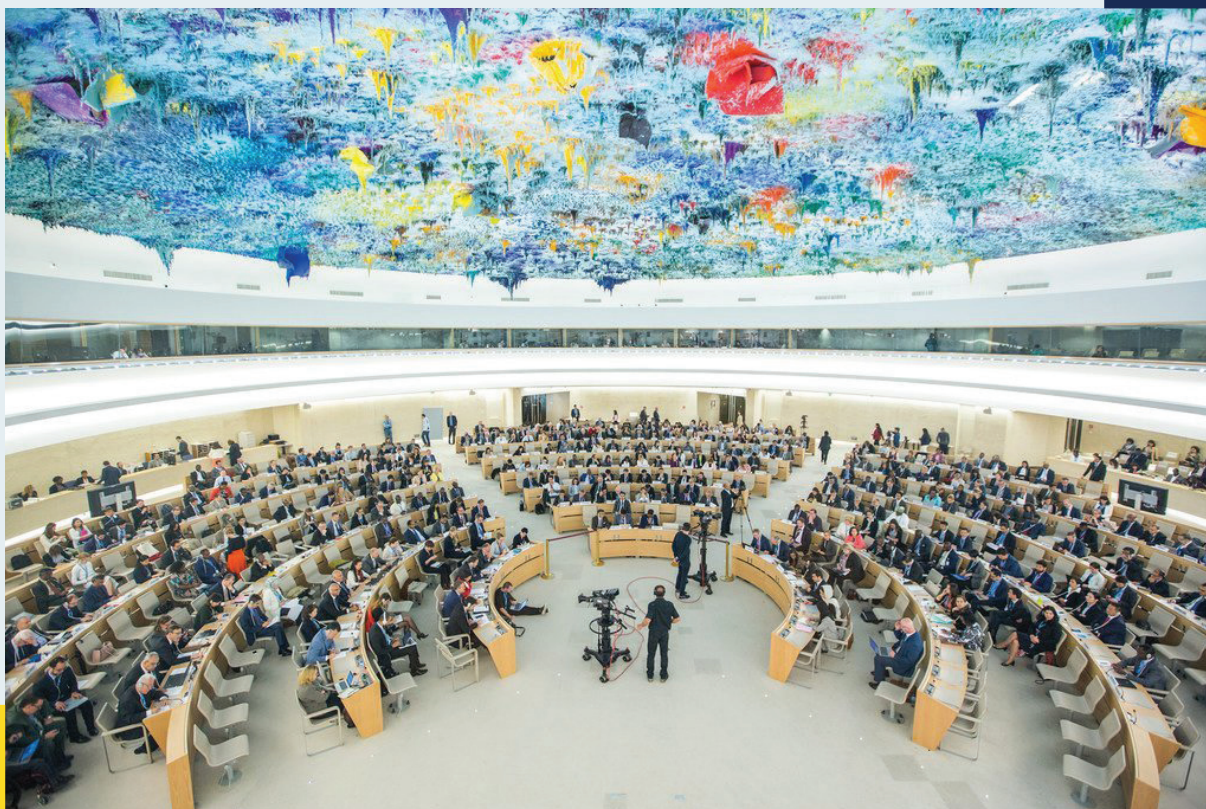
The UN Human Rights Council.