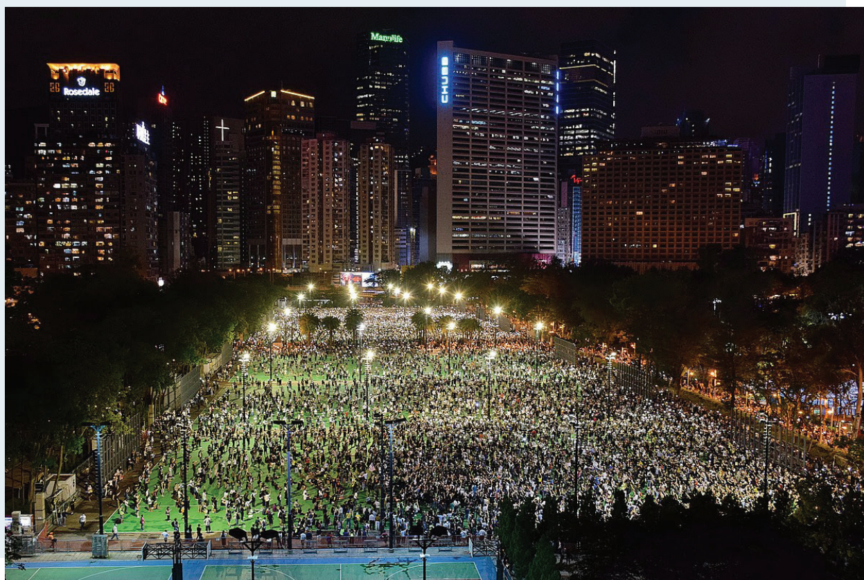
Tiananmen candlelight vigil in Victoria Park.

The Hong Kong Human Rights Monitor is a local human rights organisation founded in Hong Kong in the 1990s, focusing on the monitoring of the implementation of international human rights standards in Hong Kong, and actively engaged with the United Nations' human rights mechanisms. It suffered from stigmatisation by pro-China media outlets for a long time, but used to enjoy a certain degree of respect from the Hong Kong authorities. In recent years from 2014 onwards, pro-Beijing media outlets have from time to time reported that the group received funding from the National Endowment for Democracy (NED) and repeated the narrative that human rights organisations are planted in Hong Kong by foreign forces to do their bidding. Its founding chairperson Paul Harris, a veteran human rights lawyer and former chairperson of the Hong Kong Bar Association, was questioned by the national security police in March 2022 and fled the city shortly after. It's reported that the meeting was related to the reporting and monitoring work of the Hong Kong Human Rights Monitor. 59