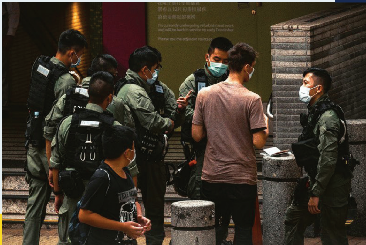
Police officers in Hong Kong.