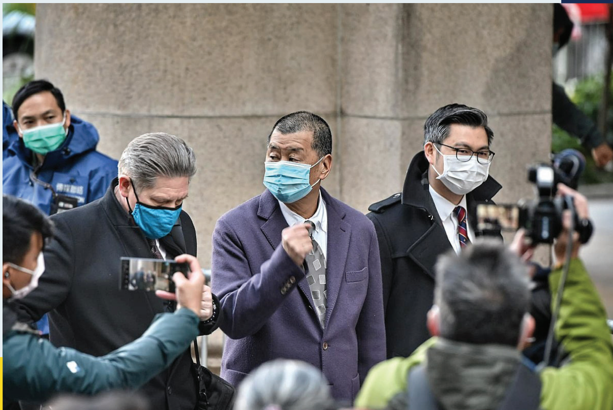
Apple Daily founder Jimmy Lai outside Hong Kong Court of Final Appeal, December 2020.