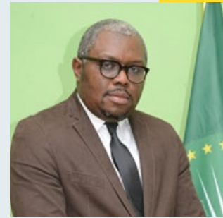
Commissioner Rémy Ngoy Lumbu , Chair of the African Commission on Human and Peoples' Rights, Special Rapporteur on Human Rights Defenders, Focal Point on Reprisals and Focal Point on Judicial Independence in Africa

Since the adoption by the United Nations General Assembly of the Declaration on Human Rights Defenders in 1998, there has been a great deal of progress towards better protection of the rights of human rights defenders around the world, and particularly in Africa. At regional level, the African Commission on Human and Peoples' Rights (the African Commission) created the mechanism of the Special Rapporteur on Human Rights Defenders in 2004 through Resolution 69 (XXXV) 03 1 , which was subsequently extended to issues relating to reprisals against defenders engaging with regional human rights mechanisms by Resolution ACHPR/Res.273 (LV) 2014 2 . The African Commission has also adopted more than 10 resolutions on the protection of defenders since the creation of the mandate and established in 2018 a Support Group for the promotion and monitoring of the effective implementation of the Guidelines on Freedom of Association and Assembly in Africa 3 adopted in 2015. At national level, five countries in Africa have adopted national laws to protect and promote the rights of defenders and three of these countries have also established protection mechanisms to ensure the implementation of these laws. 4